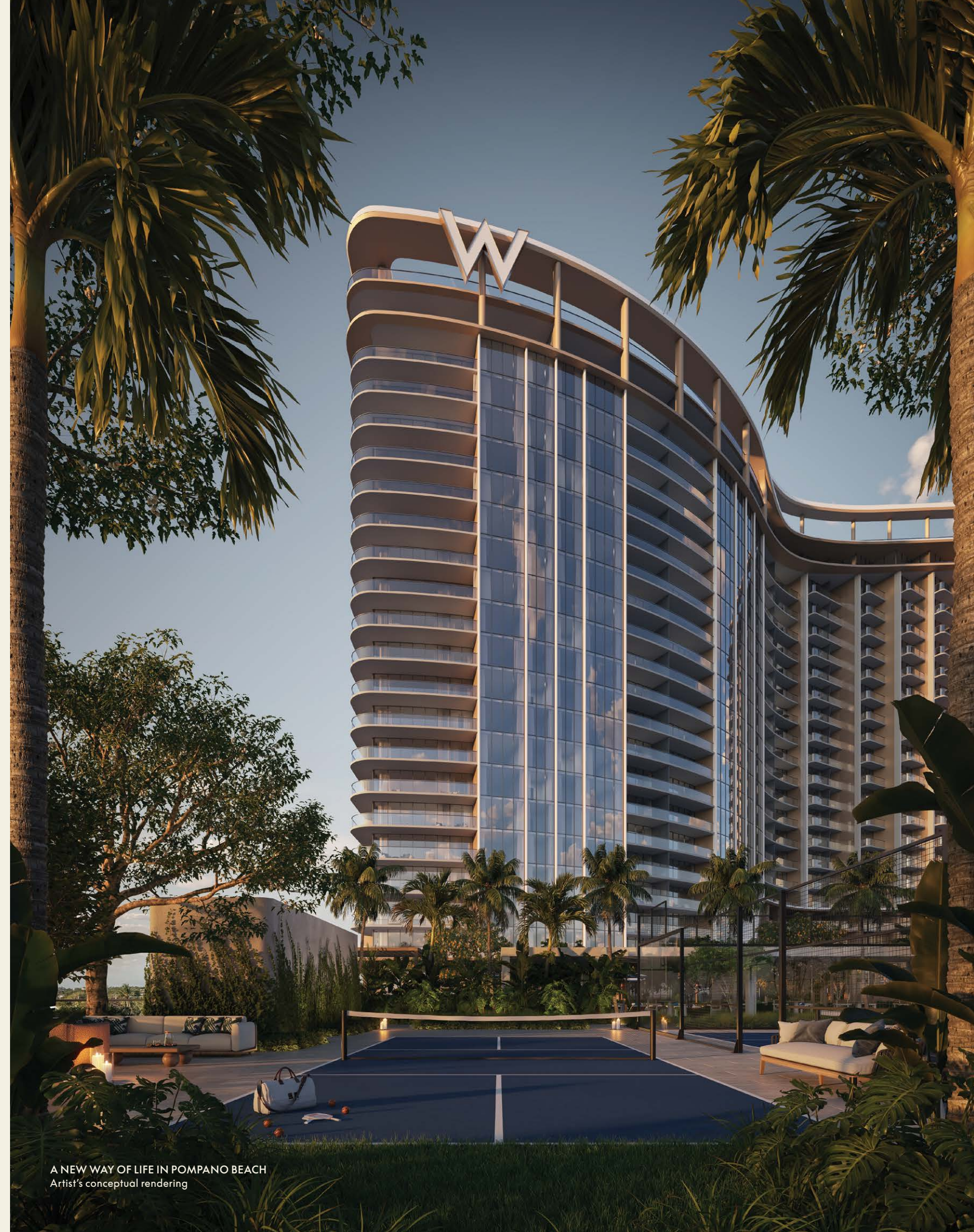
A NEW WAY OF LIFE IN POMPAÑO BEACH Artist's conceptual rendering

Founded by renowned Swiss landscape architect Enzo Enea, Enea Landscape Architecture is an internationally renowned firm known for creating extraordinary outdoor environments. Enea brings over three decades of experience in blending art, nature, and architecture to craft timeless landscapes. Enea's diverse portfolio includes private residences, urban parks, luxury developments, hospitality projects, and public spaces. Their designs feature meticulously curated outdoor spaces that seamlessly integrate with the architecture. They use native plants, sculptural elements, and creative architectural solutions, ensuring aesthetic appeal and sustainability, all while respecting the genius loci of Pompano Beach. Whether it's tranquil courtyards, lush rooftop gardens, or sophisticated pool areas, Enea Landscape Architecture creates serene and inviting spaces for residents and guests to enjoy. Their designs elevate the living experience, offering a harmonious connection between nature and the built environment.