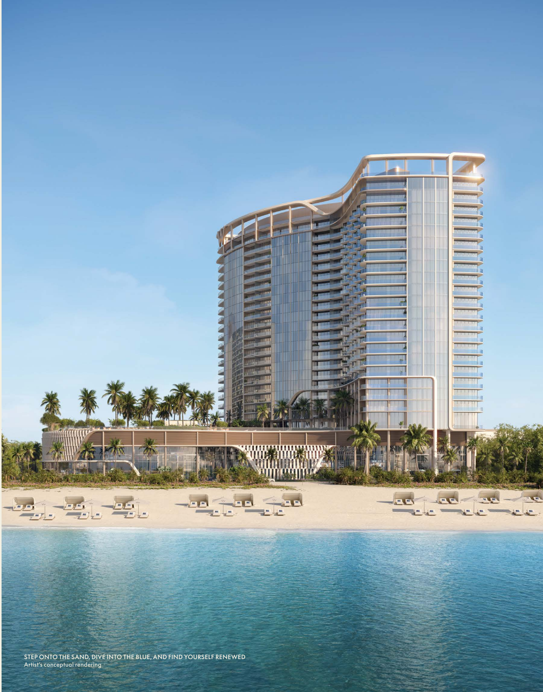
STEP ONTO THE SAND, DIVE INTO THE BLUE, AND FIND YOURSELF RENEWED Artist's conceptual rendering