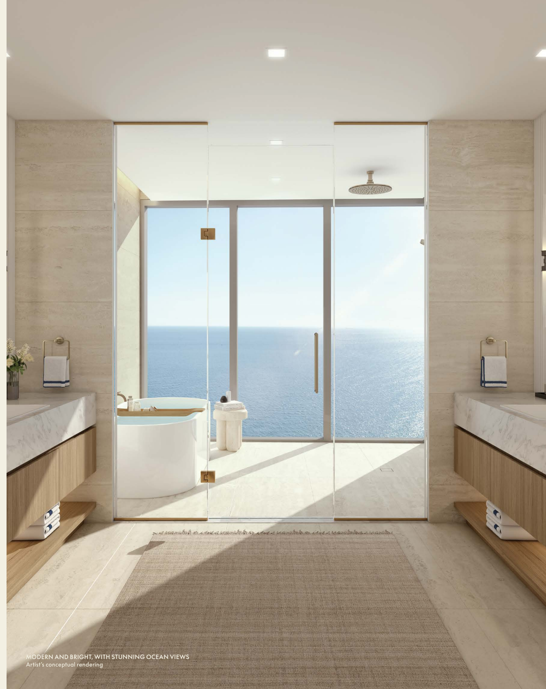
MODERN AND BRIGHT, WITH STUNNING OCEAN VIEWS Artist's conceptual rendering