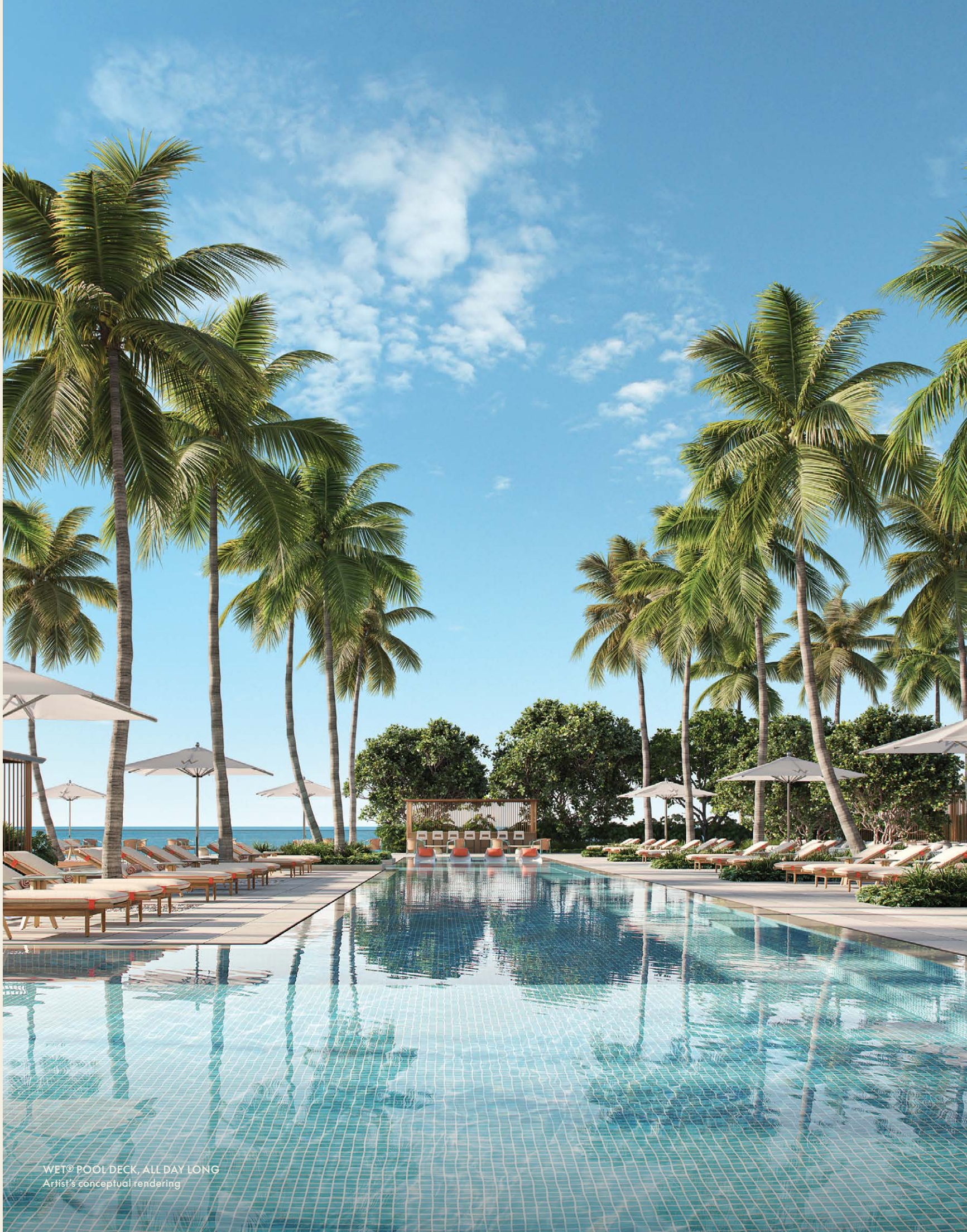
WET® POOL DECK, ALL DAY LONG Artist's conceptual rendering